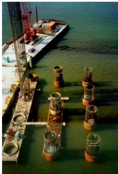
Installation of drilled shafts for the new Cooper River Bridge, Charleston, SC.

Ben C. Gerwick Inc. is well known for its innovative design solutions and