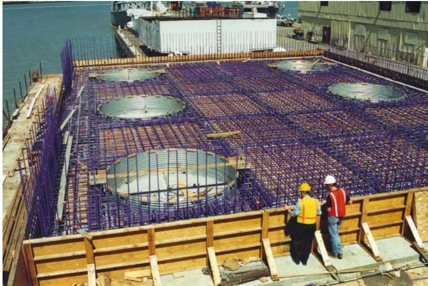
Casting of float-in cofferdam for Installation of drilled shafts for support of the four main tower legs of the New Carquinez Bridge, Crocket, CA.

Ben C. Gerwick, Inc. has completed foundation designs utilizing drilled shafts on numerous projects in the U.S. and provided expertise on projects worldwide. This area of foundation engineering involves the difficulties of maintaining the interface between the superstructure, substructure, and foundations, where severe restrictions and tolerances are often imposed.